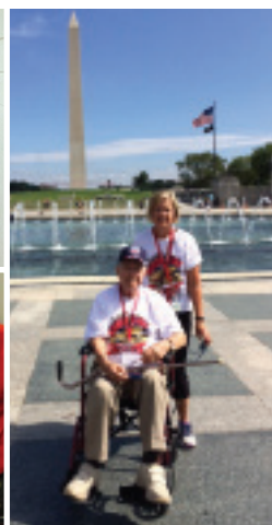
Assisted Living residents have a busy social engagement calendar that includes many outings, family gatherings, and fun visits on the holidays!