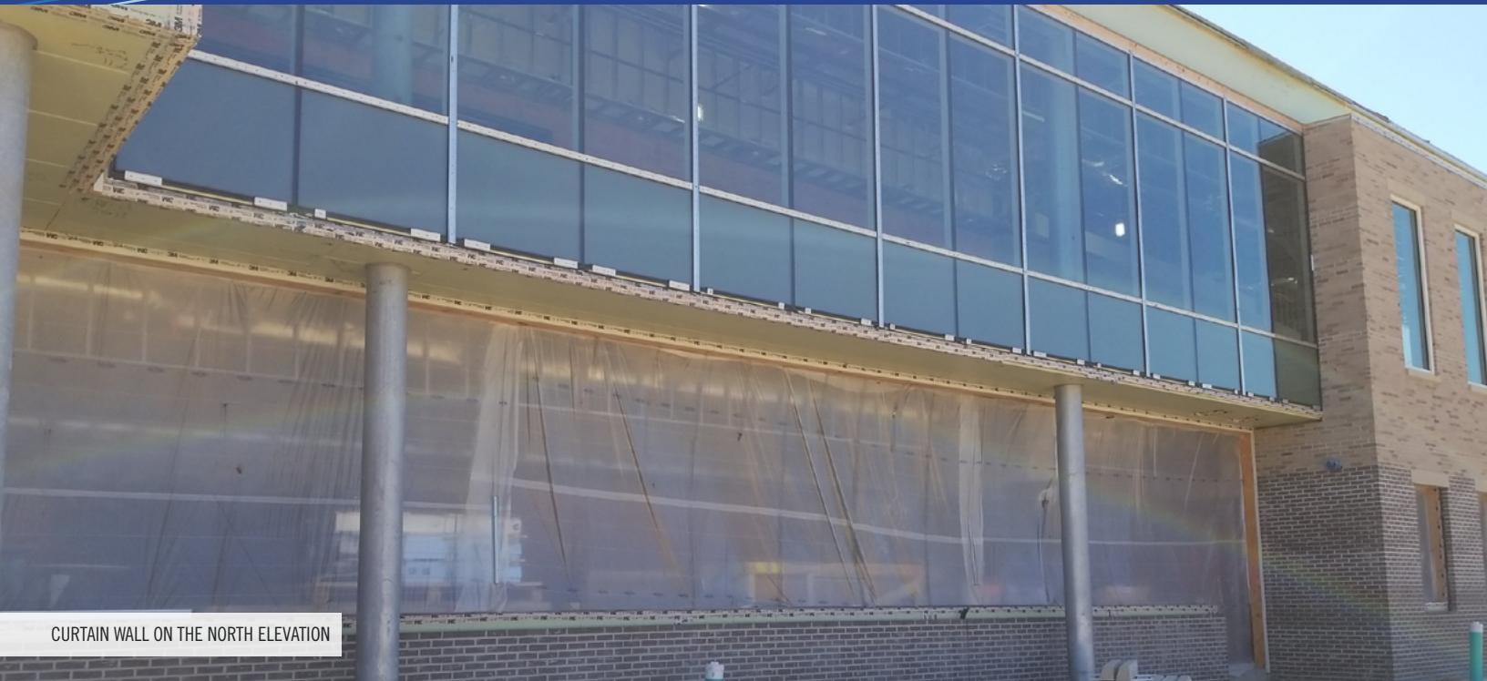
CURTAIN WALL ON THE NORTH ELEVATION