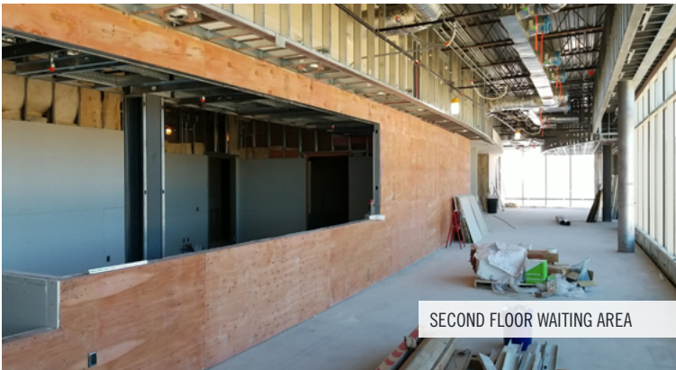
SECOND FLOOR WAITING AREA

With most of the drywall complete on the second floor, priming and base coat painting has begun and will move quickly through the many small rooms. Following this, more finishes such as ceiling grid and lighting can be installed. On the exterior of the building, masonry is nearly complete, and the glass curtain wall systems are being installed around the north and east walls. Site work is also continuing around the campus with construction of the new parking which spans from the existing MOB to the main hospital entrance. After the current phase of parking lot construction is complete north of the new building, the next phase will be taking place in front of the walk-in clinic.