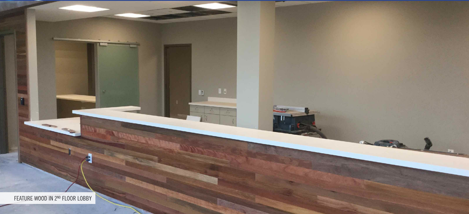
FEATURE WOOD IN 2 ND FLOOR LOBBY