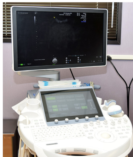
3D ultrasound is now available at the hospital's obstetrics and gynecology practice.

our patients. They can get an ultrasound without having to make another appointment or travel to the hospital. If we think there might be a problem with the pregnancy, we can take a look immediately."