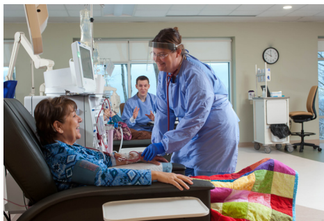
Elizabeth C. Hosick Dialysis Center in Frankfort.

Two Munson Healthcare Dialysis Centers have earned a five-star rating from the Centers for Medicare and Medicaid Services (CMS), an honor bestowed on only 10 percent of facilities in the nation.