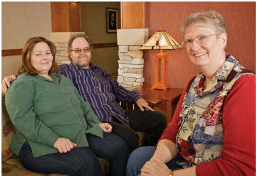
* Only employees who live in Kalkaska county