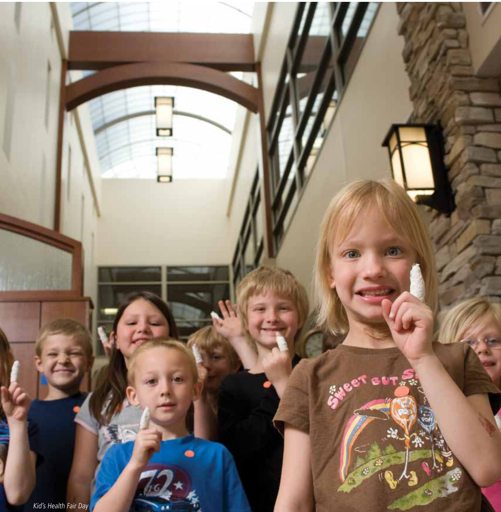
Kid's Health Fair Day