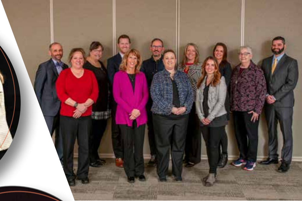
KMHC Senior Leadership Team