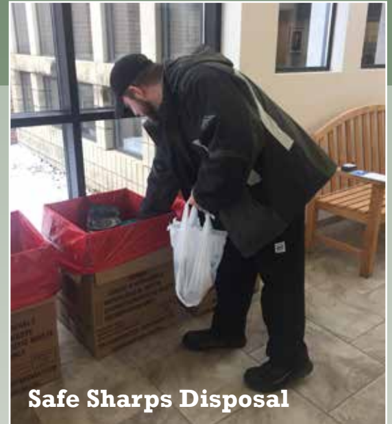
Safe Sharps Disposal

In 2016, Kalkaska Memorial Health Center received several questions and concerns about proper disposal of sharps (needles). Community members expressed difficulty in finding an affordable and safe way to dispose of sharps. After research and speaking with other communities, KMHC started holding Community Sharps Disposal Days every few months. So far, KMHC has provided free and safe disposal of hundreds of pounds of needles for patients, local businesses, and schools.