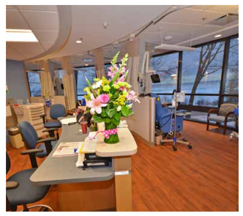
Peaceful views at the Chemotherapy and Infusion Center at Munson Healthcare Charlevoix Hospital.