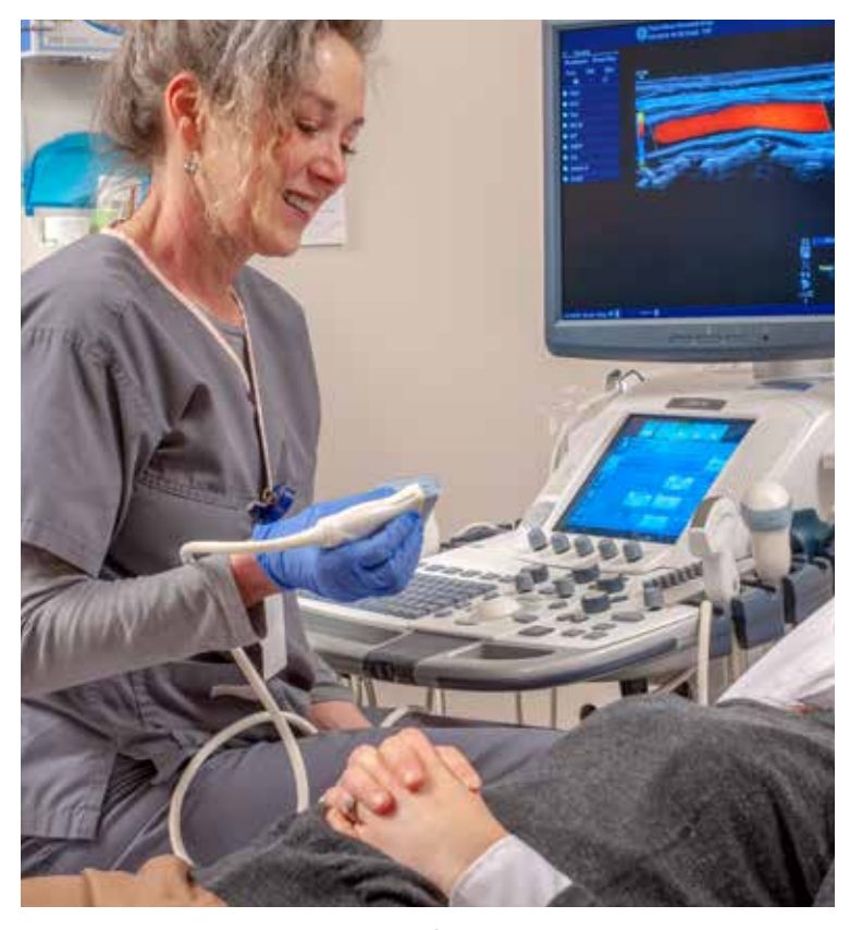
Cardiac testing at POMH. Photo taken before COVID-19.

Over $342,000 was donated to Otsego Memorial Hospital to help purchase a new stereotactic breast biopsy table, which pinpoints breast tissue to identify cancerous cells and determine the best possible treatment plans.