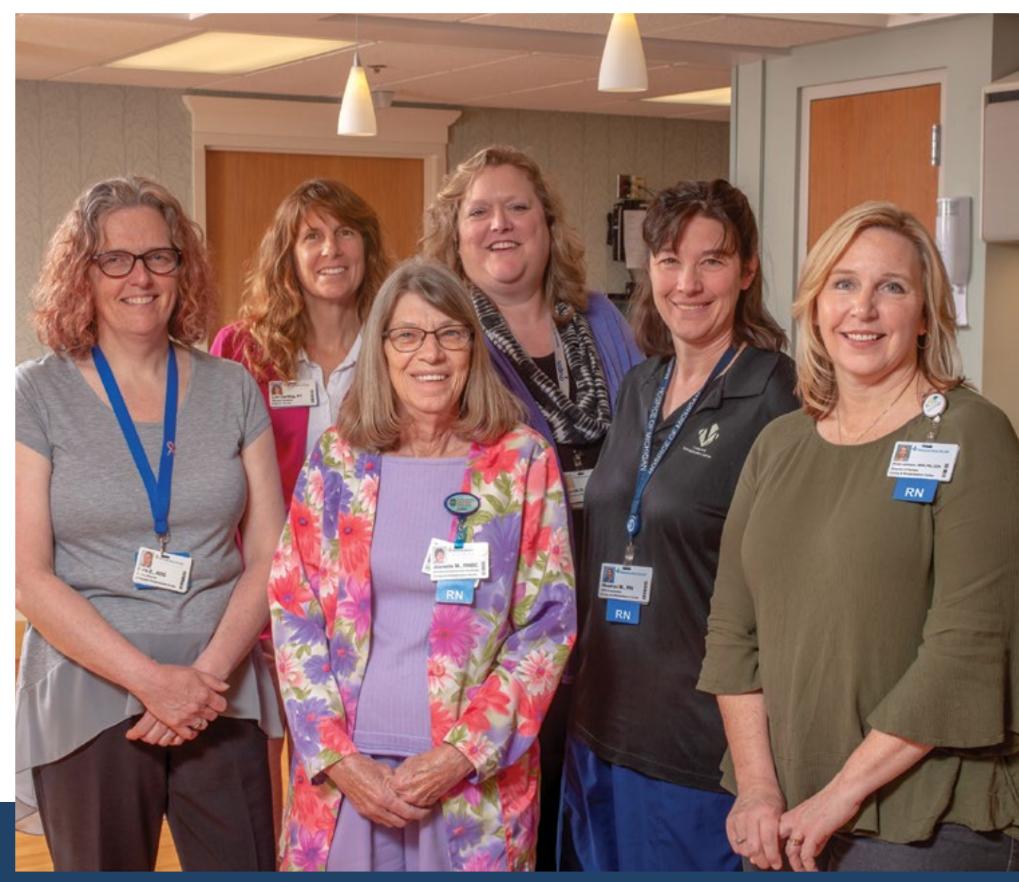
Munson Healthcare Paul Oliver Memorial Living & Rehabilitation team.

In 2017, we provided one-on-one support to 20 people navigating the health insurance exchanges and selecting an insurance policy, ensuring our community members have the medical insurance coverage they need.