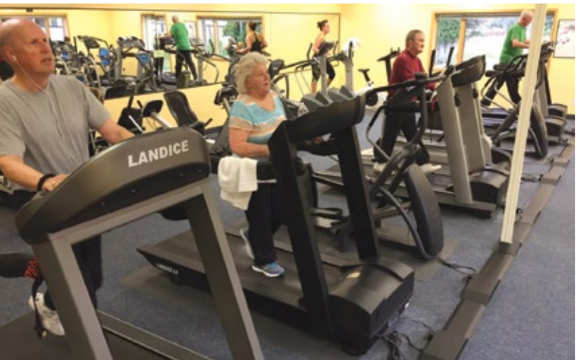
Top: Stretching before Yoga class at Betsie Hosick Health and Fitness Center. Below: Cardio Fitness area.

beyond the fitness center walls, we offer free classes to enhance health and wellness at locations throughout the community, including on the Frankfort beach, at Paul Oliver child development summer camps, and in nearly every senior living facility in Benzie County. In 2017, these efforts reached more than 4,500 people participating in 550 classes.