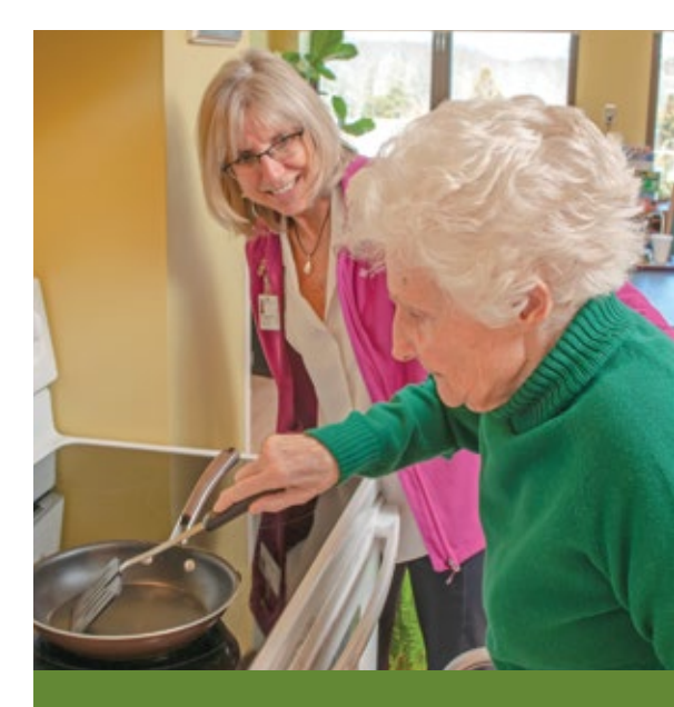
"Shout Outs" cont. from previous page

Individuals who received specialty care at Paul Oliver saved a total of 299,400 round trip miles by receiving these services close to home.