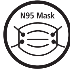
NIOSH Approved Respirator (N95 or PAPR/CAPR)