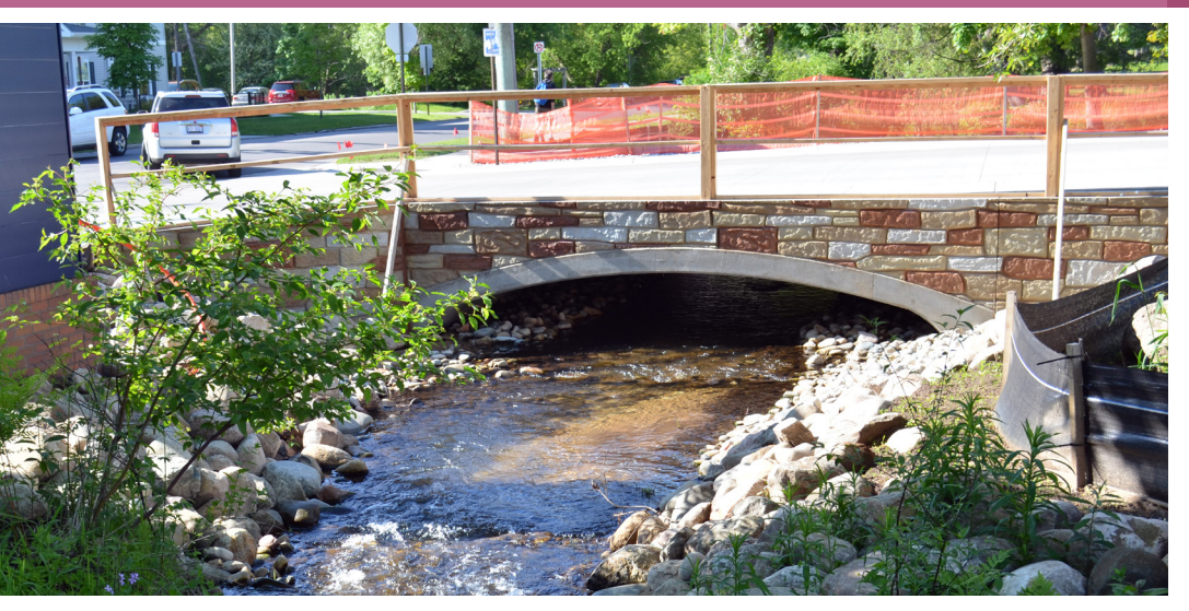
A new bridge over Kids Creek at the Seventh Street entrance to the Emergency Department completes creek restoration efforts on MMC's campus.