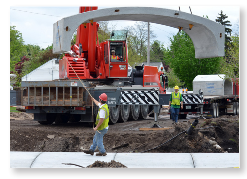
A Traverse City worker guides a piece of bridge for Kids Creek into place.

Partnerships with the Watershed Center Grand Traverse Bay, Grand Traverse Conservation District, and others over the decade have brought new life to the stream and provided a natural oasis for patients and visitors on challenging days.